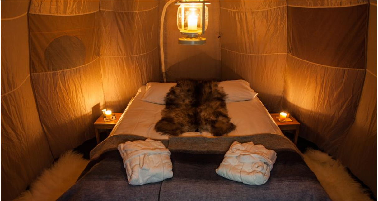
In the camp you have a sauna where you can relax after a busy day experiencing the Icelandic nature, a hot water shower and a toilet.